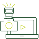
Photo and Video

Creating high-quality photos and videos through concept development, location and studio production and editing services.